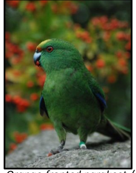
Orange-fronted parakeet / kākāriki karaka.

In the last three years the Trust has successfully raised for release 66 birds into Lake Sumner Forest Park, with the support of DOC, Ngāi Tahu for whom kākāriki karaka is a taonga species, and Christchurch Helicopters.