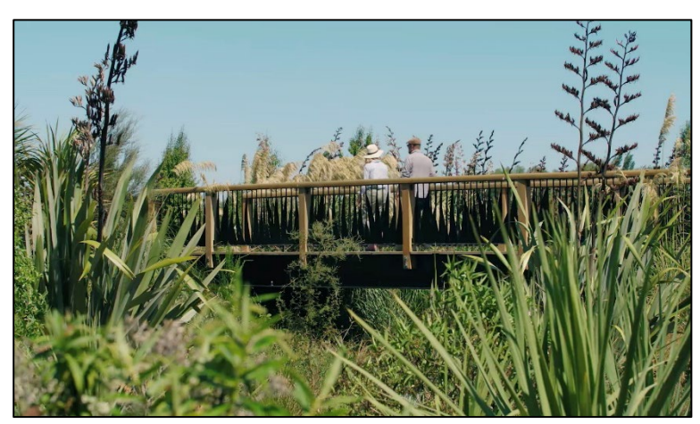
Walkways provide public access to riparian conservation.

Replacing plant pest species with native riparian planting is ongoing exercise along the Ōtukaikino waterways. The Trust's work has included fencing off riparian margins from stock, with some 60,000 natives planted to date; and creating streamside walking tracks for public access along the eastern boundary adjacent to Clearwater Golf Resort. Land clearance along this corridor has occurred in partnership with Environment Canterbury, Christchurch City Council, the New Zealand Fish & Game Council, and the Department of Corrections.